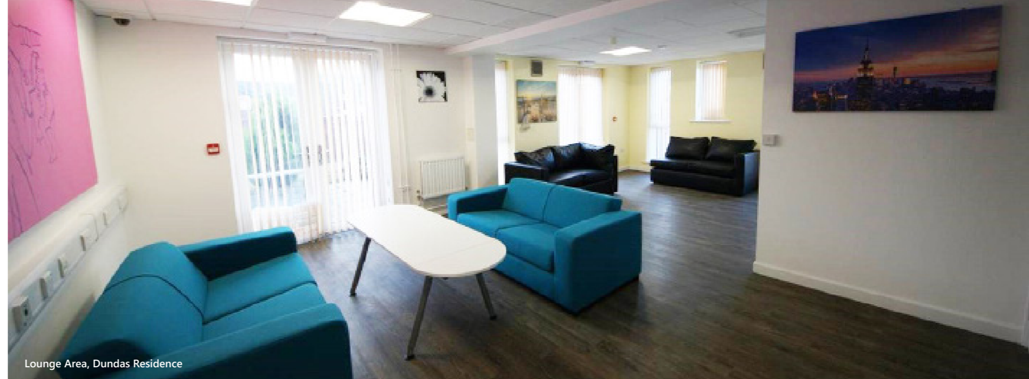
Lounge Area, Dundas Residence