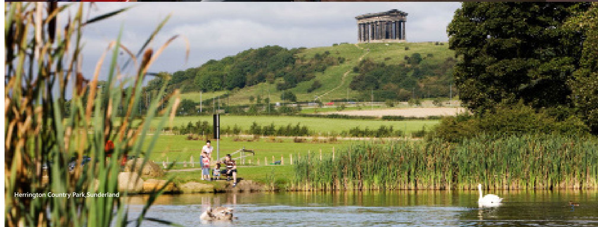
Herrington Country Park, Sunderland