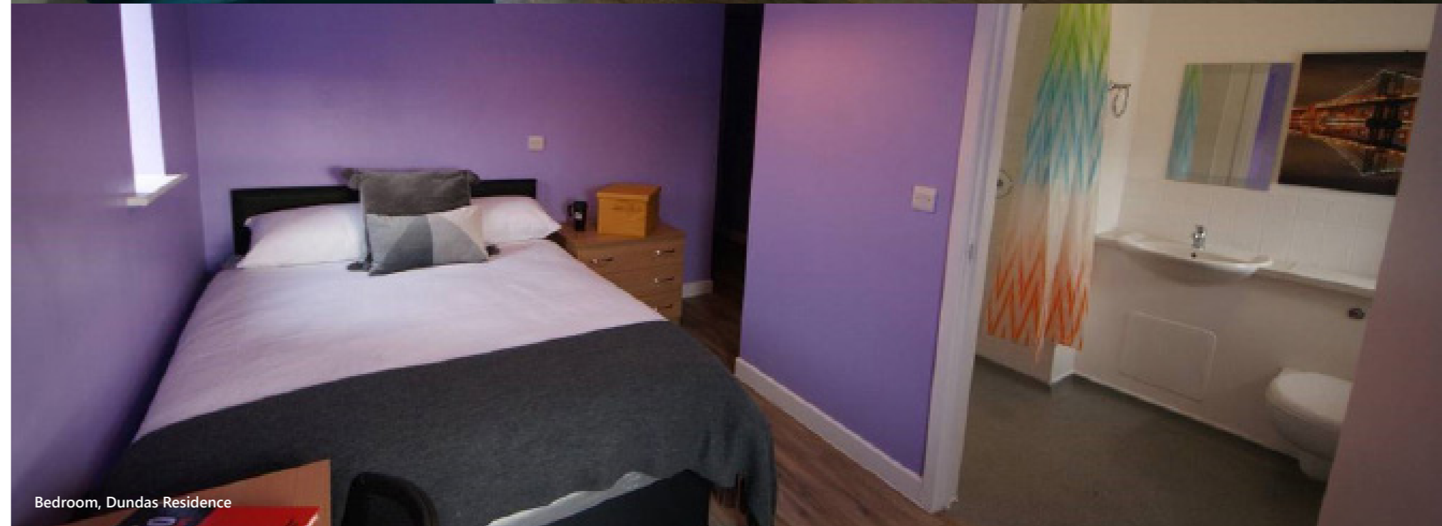
Bedroom, Dundas Residence