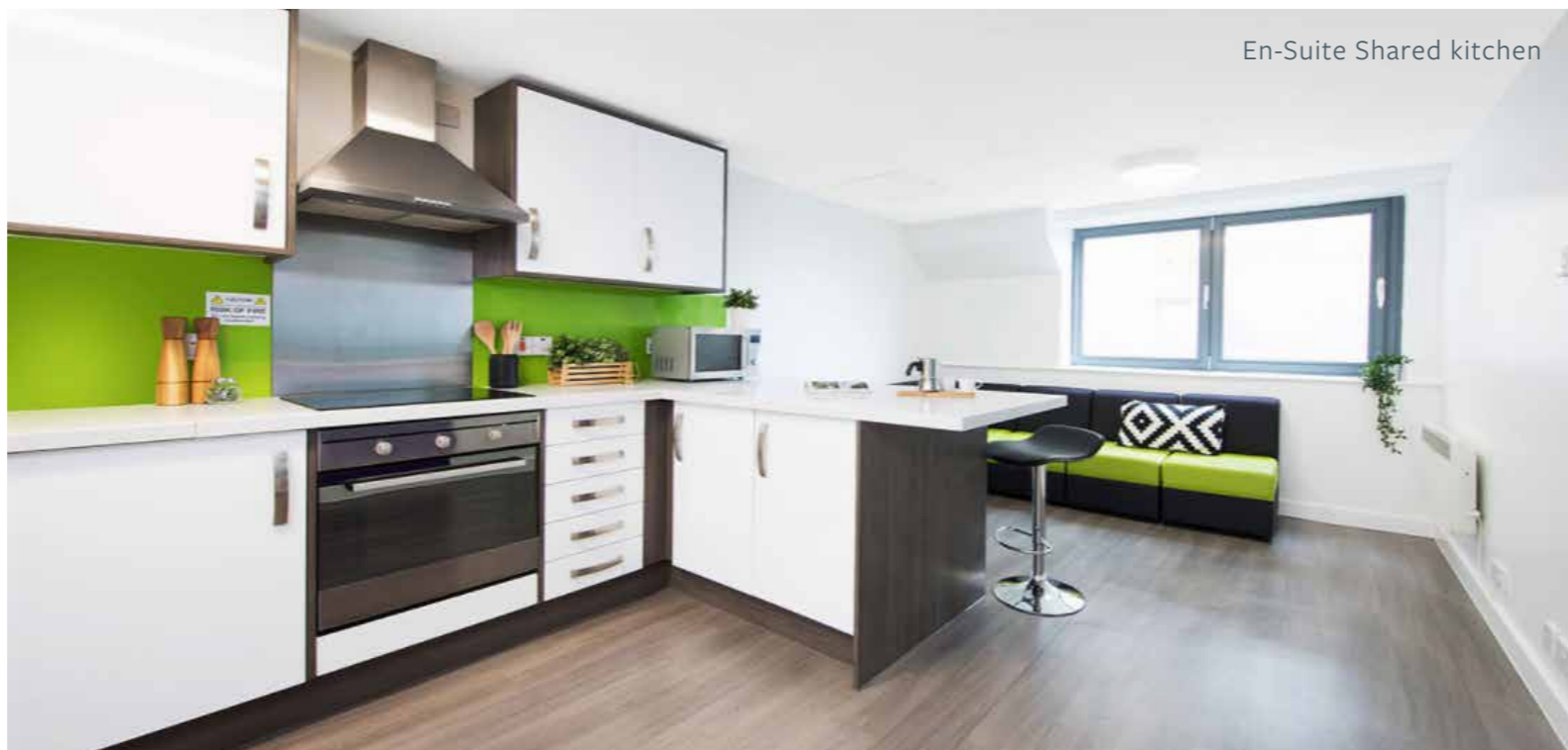
En-Suite Shared kitchen