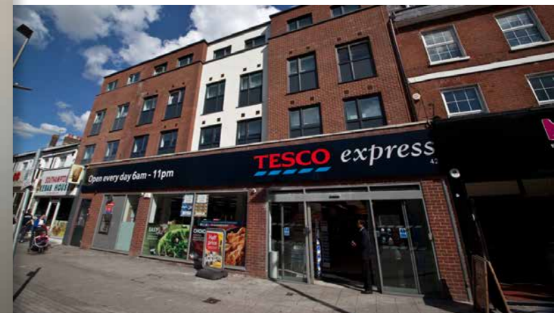
London Road is owned and managed by Hello Student